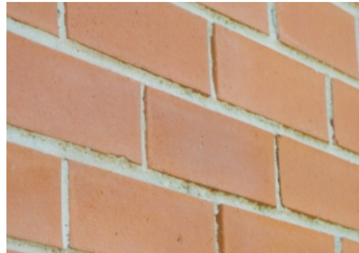
Damage to mortar joints caused by high-pressure cleaning